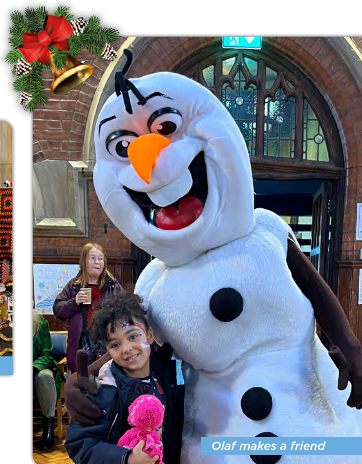
Olaf makes a friend