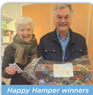
Happy Hamper winners