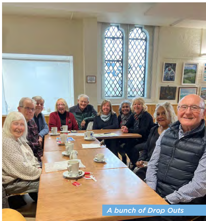
A bunch of Drop Outs