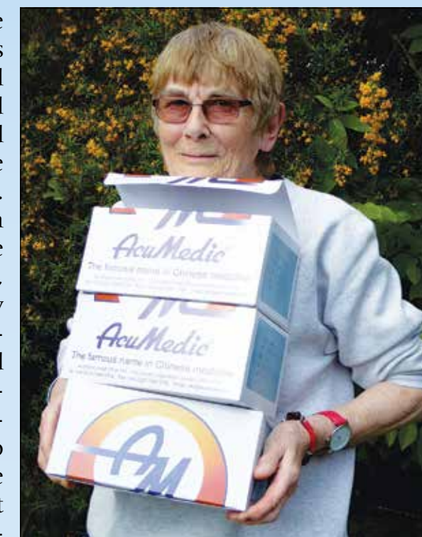
Needles get ordered in bulk.

Generally speaking acupuncture works very well in 25% of people, not at all in 25% and, to a variable degree in the other 50%. Fine needles are inserted into the body at various points and gently manipulated. The meridians link these points and use the name of the organ with which they