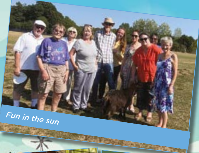
Fun in the sun

Separate from the others was a large black goat. Its coat glistened in the dappled sunlight that came through the tree canopy where the herd had so cleverly placed themselves to be out of the intense direct heat of the afternoon sun.